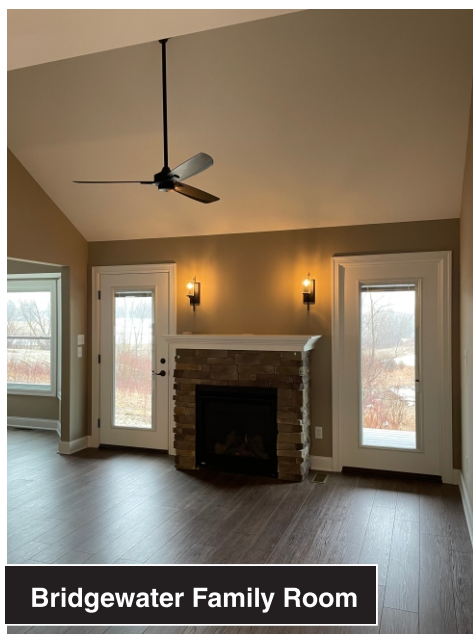
Bridgewater Family Room

The completed two-bedroom, two-bathroom Andover model is ready to view. As you enter through the garage, you'll step into the laundry room. A coat closet and handcrafted wood-stained bench with hooks above are stationed to your left. Granite countertops with a gorgeous full tile backsplash and decorative range hood adorn the kitchen. The cabinetry is tall with a glass display and lower cabinet microwave. The walk-in pantry is ideal for those who love to create in the kitchen. You'll be captivated by the open layout containing the kitchen, dining room, and living room with the cathedral ceiling and custom Ledgestone gas fireplace. Step out onto the covered deck to enjoy the view. The master bedroom is spacious with an impressive wood shelving system installed in the walk-in closet making all your clothing organization dreams come true. As you step into the master bath,