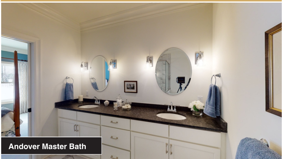
Andover Master Bath

Prospective buyers are invited to schedule a tour at The Cottages where they will be able to experience the beautiful and thoughtful design of the model, along with the layout of the community. Tours at the model, located at 6385 Boston State Road, Hamburg are open Saturdays from 1pm-4pm or by appoint-