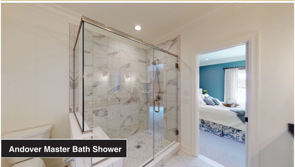
Andover Master Bath Shower