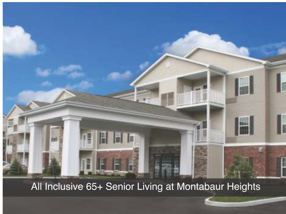
All Inclusive 65+ Senior Living at Montabaur Heights