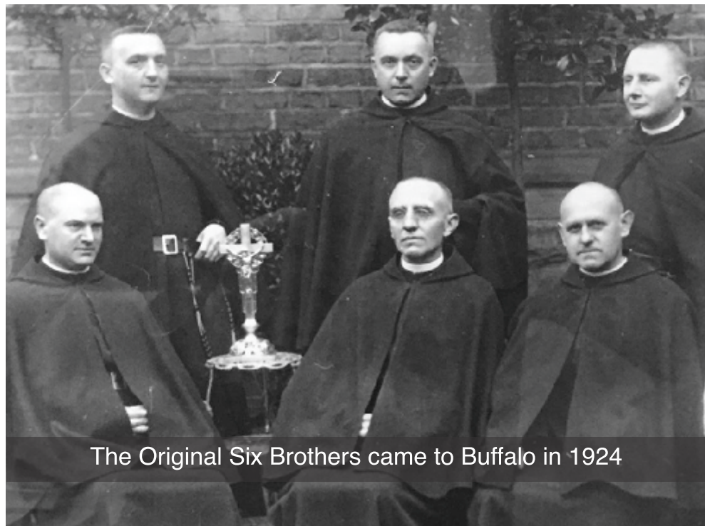
The Original Six Brothers came to Buffalo in 1924

Locally owned and non-profit, the Brothers of Mercy's Catholic mission places resident wellness at the center of everything they do. Serving WNY seniors for nearly 100 years, the work on the Brothers of Mercy campus has continually been recognized for excellence. In 2019, Buffalo Business First ranked Brothers of Mercy WNY's largest Retirement Community (521 total units), WNY's largest 5-Star rated Skilled Nursing Facility (240 beds), WNY's largest Independent Living Community (211 beds) and in the Top Twenty of both WNY's best Physical and Occupational Therapy Programs. This year Newsweek magazine ranked Brothers of Mercy the 12th (out of 627) Best Nursing Home in New York State. They are also the largest private employer in Clarence, NY (over 600 employees) with an annual economic impact of $60M.