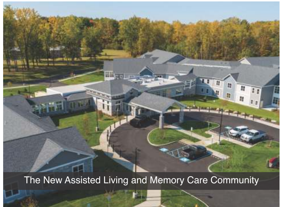
The New Assisted Living and Memory Care Community

At the Brothers of Mercy, the level of dedication, commitment and genuine care the staff provides is one of the things they are most proud of. It's these type of personal characteristics that make a profound difference in the lives they touch. As a historical landmark in WNY, the entire Brothers of a Mercy campus has earned a reputation for treating seniors with dignity and respect.