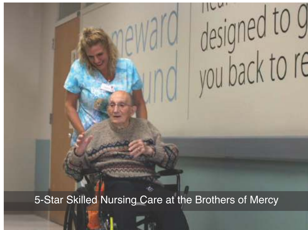
5-Star Skilled Nursing Care at the Brothers of Mercy

Offering a continuum of lifestyle and care options on a 126-acre campus in Clarence, the Brothers of Mercy ministry of services include the following: