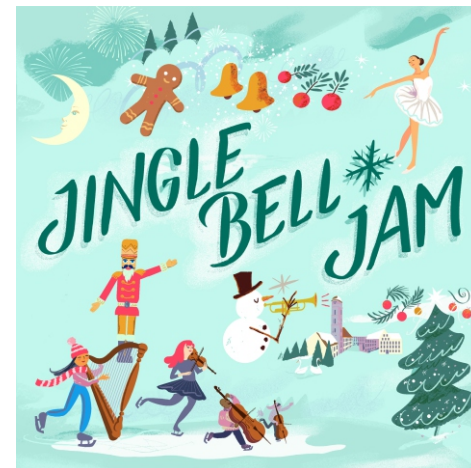
Jingle Bell Jam