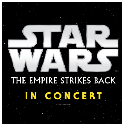
Star Wars in Concert