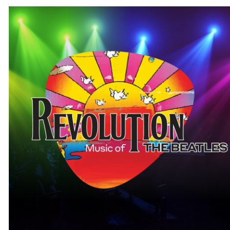
Revolution Music of the Beatles